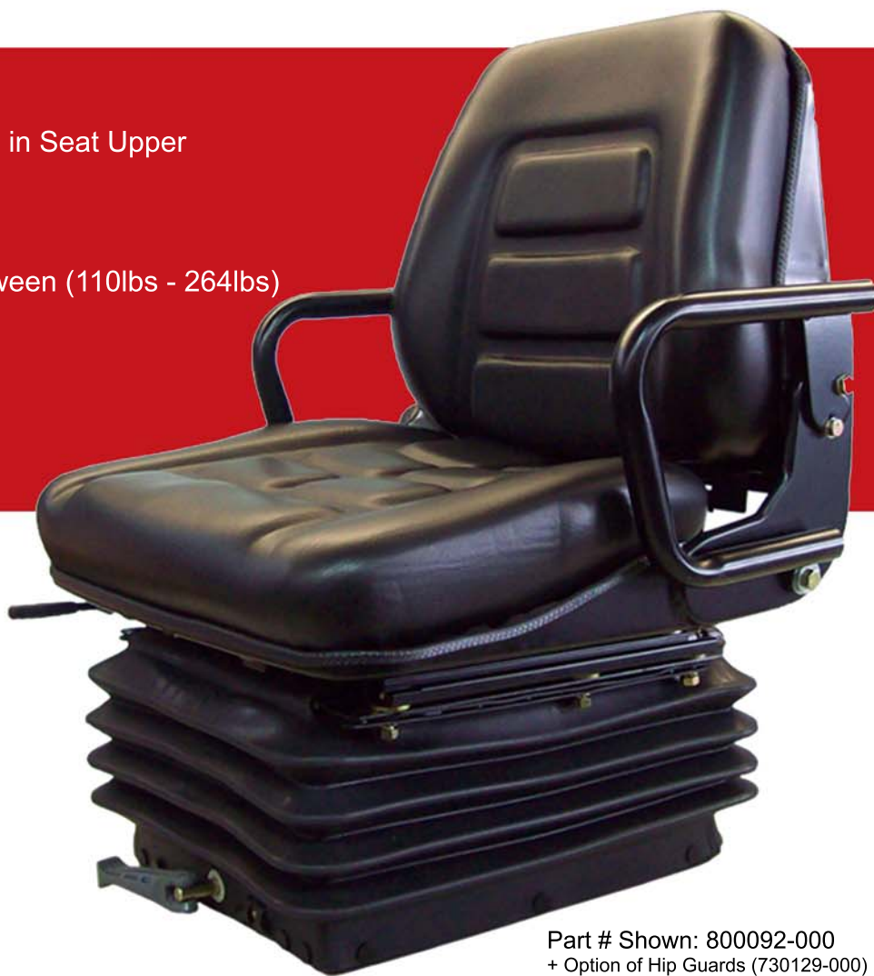
Part # Shown: 800092-000 + Option of Hip Guards (730129-000)