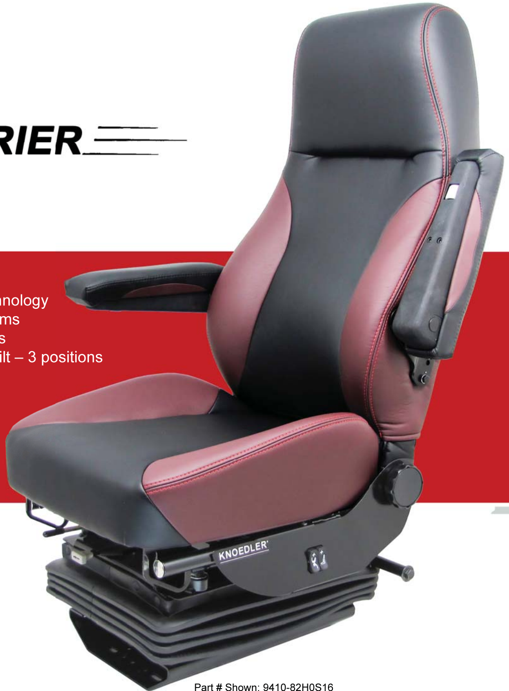
Part # Shown: 9410-82H0S16